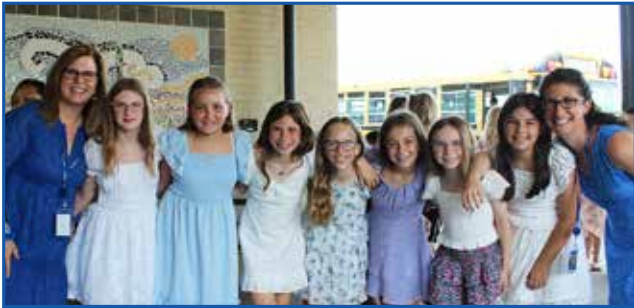
Pasadena Elementary School