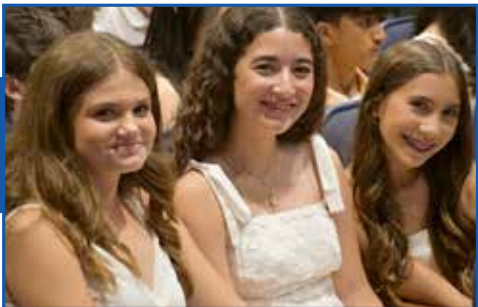
Howard B. Mattlin Middle School