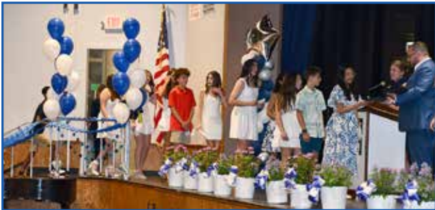
Plainview-Old Bethpage Middle School